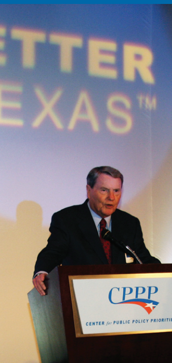
Legacy Keynote Speaker Jim Lehrer of PBS NewsHour