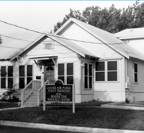
Home since 1992