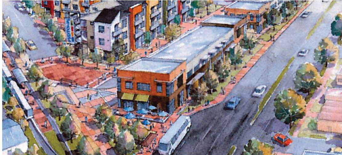
Future home on North Lamar