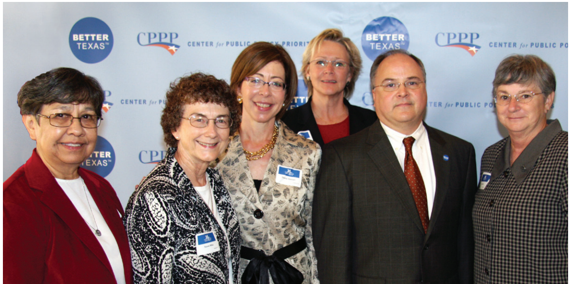
Celebrating at the Legacy Luncheon: