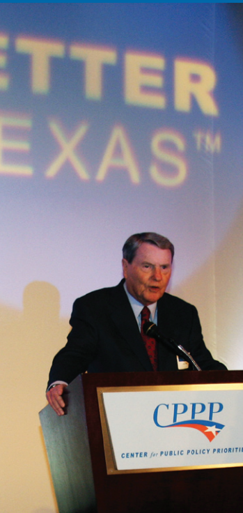
Legacy Keynote Speaker Jim Lehrer of PBS NewsHour